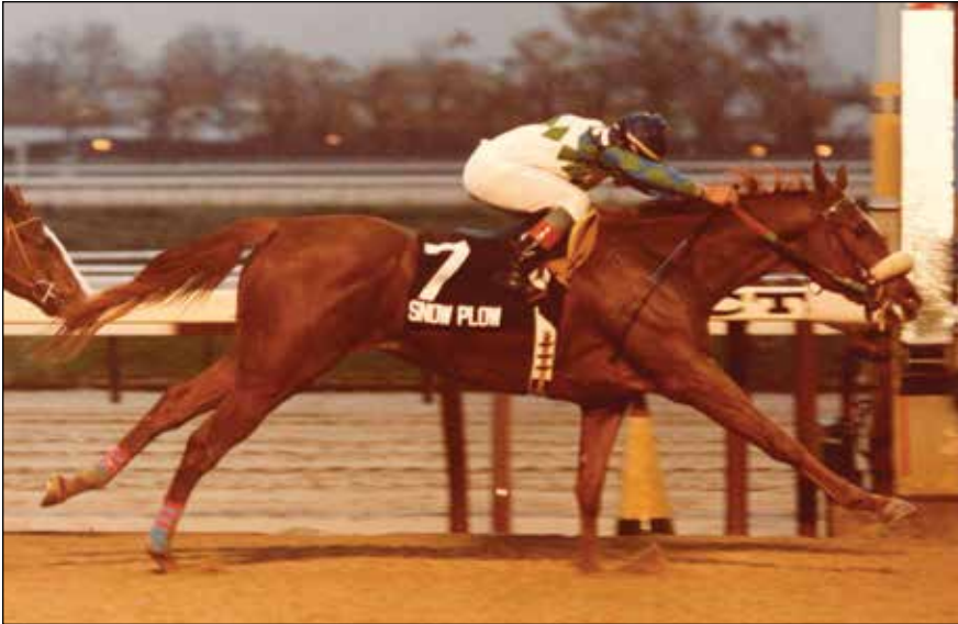
After taking the Selima Stakes as the fourth betting choice in a field of six, Snow Plow (at $1.80-to-one odds) would draw off to win the nine-furlong Demoiselle Stakes by 1 1/4 lengths over favorite Larida.

Plow's final time of 1:46 2/5 was 4 3/5ths seconds off the Laurel record.