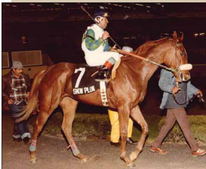
The nearly 17-hand Snow Plow heads to the gate for the Grade 1 Demoiselle Stakes at Aqueduct.

On Halloween 1981 two-year-old Snow Plow became the first Washington-bred Grade 1 stakes winner when she drew away to a 2 1/4-length victory in Laurel Park's $210,835 Selima Stakes over future Eclipse champion Ambassador of Luck. It was only the second start for the daughter of Royal Ski who had earlier taken a maiden special weight race at Belmont.