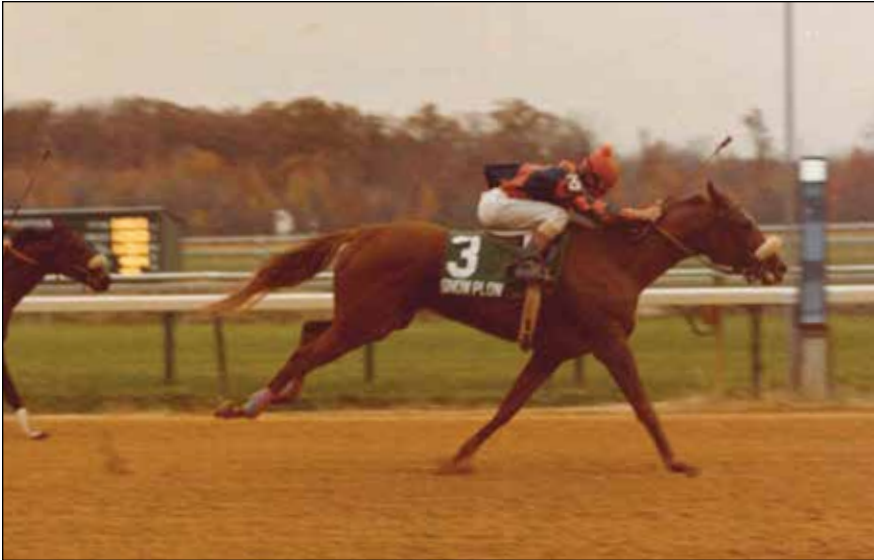
The chestnut filly cruised to a 2 1/2-length victory in Laurel Park's Grade 1 Selima Stakes in only her second start.

champion Minsky and granddam of European Horse of the Year The Minstrel.