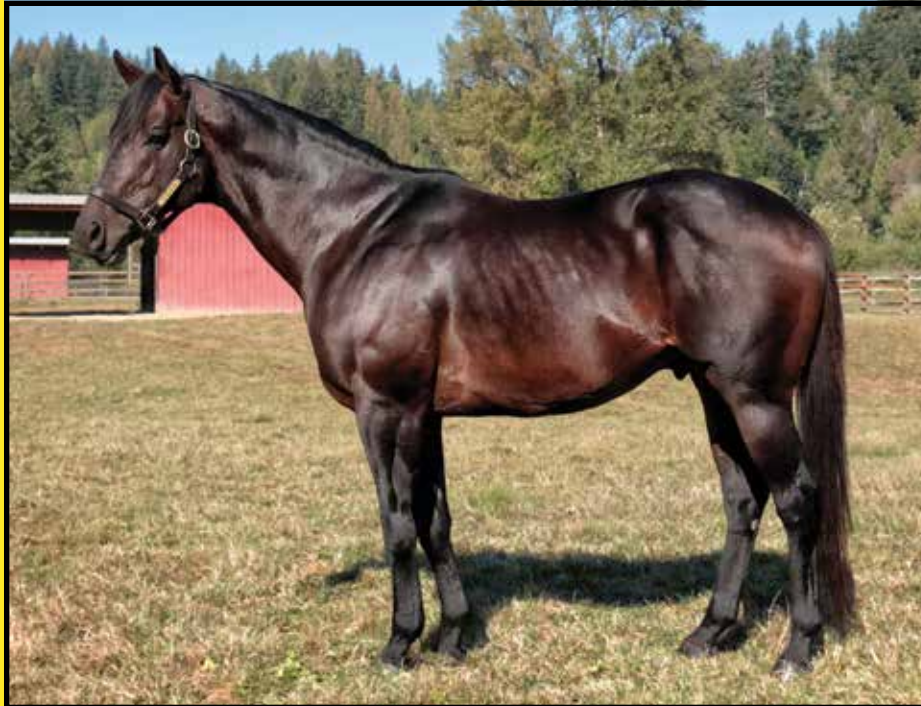
Cheri Wicklund Photo