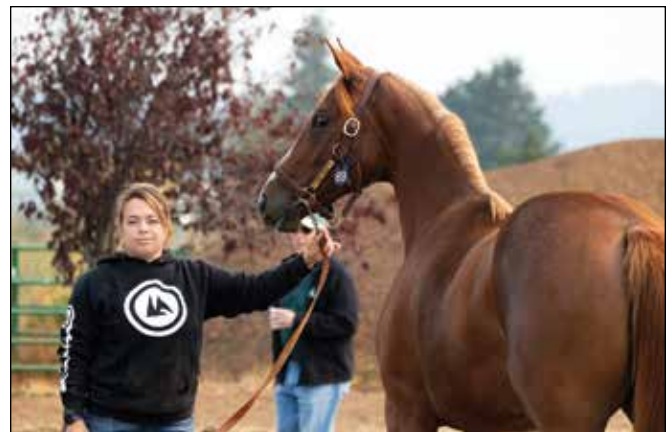
Hip 69, a filly from the final crop of Bar C Racing Stables' Pacific Northwest sire phenom Harbor the Gold.