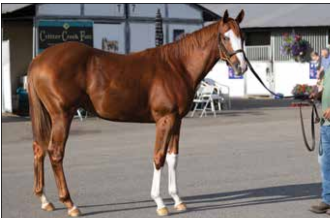
Hip 76, a flashy Barkley colt from the El Dorado Farms consignment.