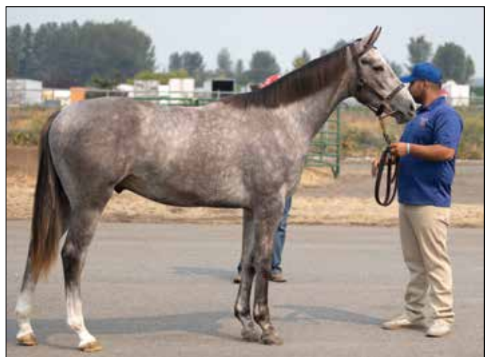
Blue Ribbon Farm also consigned Hip 65, a Conveyance hall-brother to Washington champions Elliott Bay and Pyscho Sister, which was purchased by Homer Thoroughbreds.