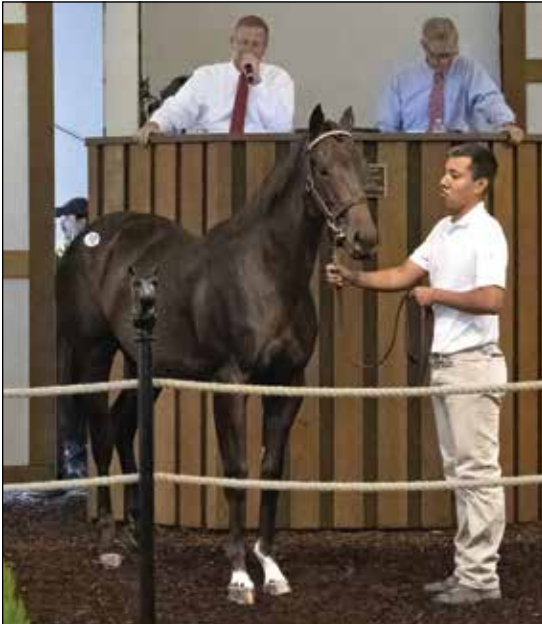
Hip 36, a Slew's Tiznow filly out of a stakes-winning half-sister to Gold Rush Dancer.