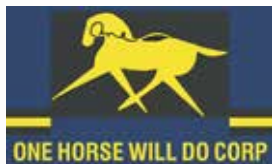
OTTB of the Year