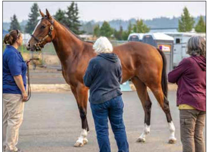
Hip 42, a Coast Guard filly out of Washington champion Find Your Spot from the Blue Ribbon Farm consignment.