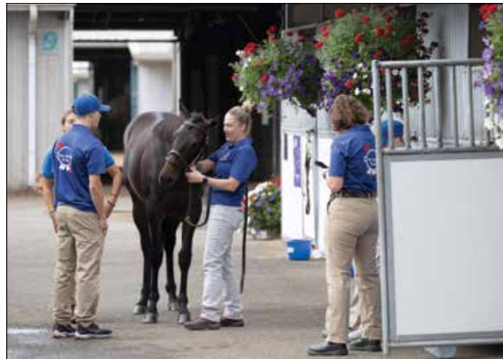
The Blue Ribbon Farm crew fine tune a yearling to be shown.