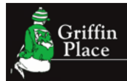
Broodmare of the Year