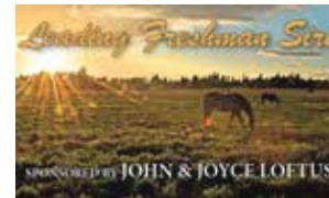
Freshman Sire of the Year