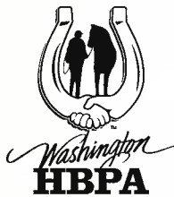
Most Improved Plater