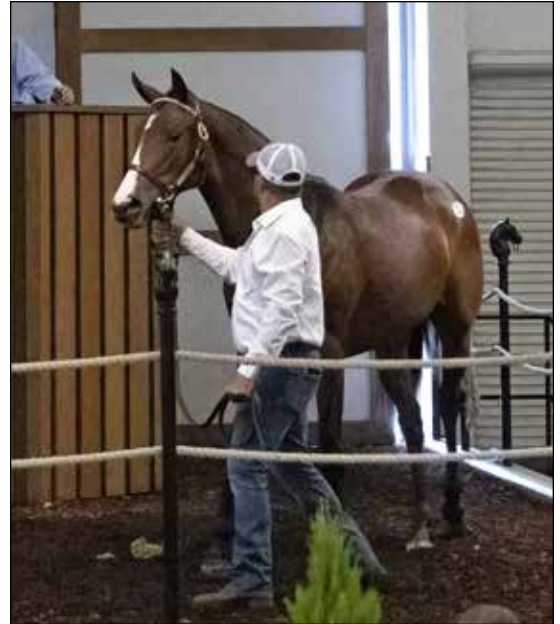
Hip 72, a Hit It a Bomb half-sister to state champion Koron.