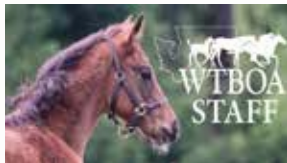
Plater of the Year